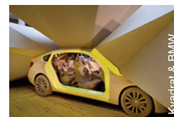
Kvadrat & BMW