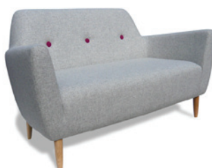
James Design UK