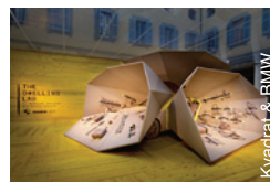
Kvadrat & BMW