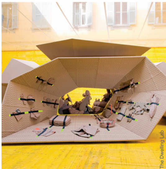
The Dwelling Lab